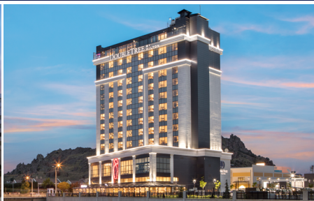
DoubleTree by Hilton Afyonkarahisar, Turkey