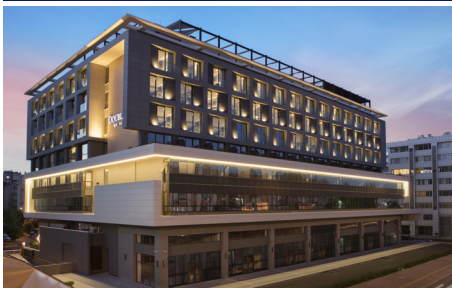
DoubleTree by Hilton Antalya City Centre, Turkey