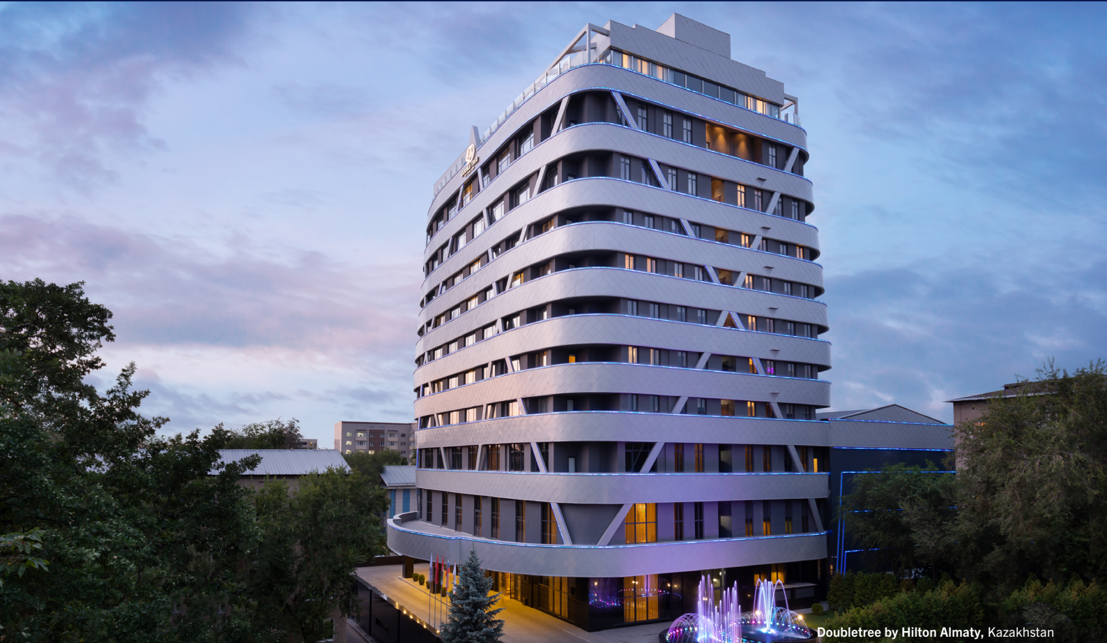
Doubletree by Hilton Almaty, Kazakhstan