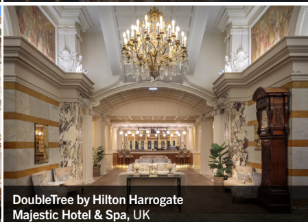
DoubleTree by Hilton Harrogate Majestic Hotel & Spa, UK