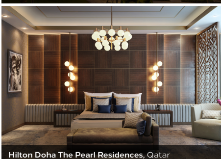
Hilton Doha The Pearl Residences, Qatar