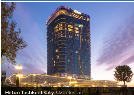
Hilton Tashkent City, Uzbekistan