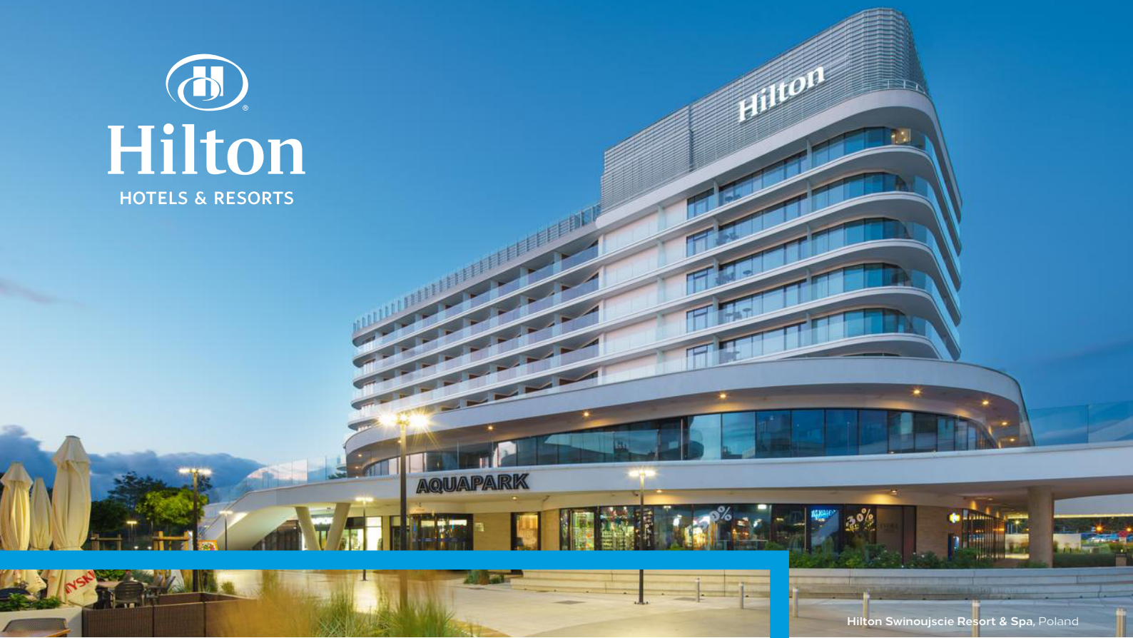
Hilton Swinoujscie Resort & Spa, Poland