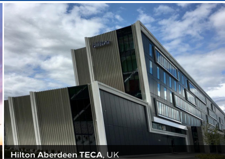
Hilton Aberdeen TECA, UK