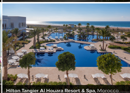
Hilton Tangier Al Houara Resort & Spa, Morocco