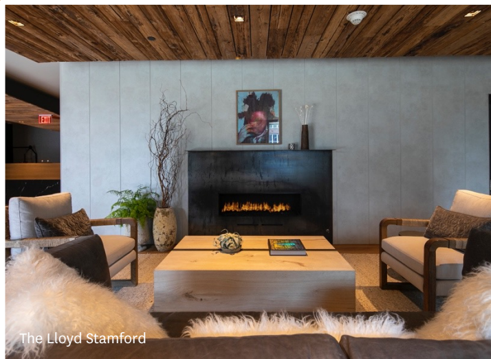
The Lloyd Stamford