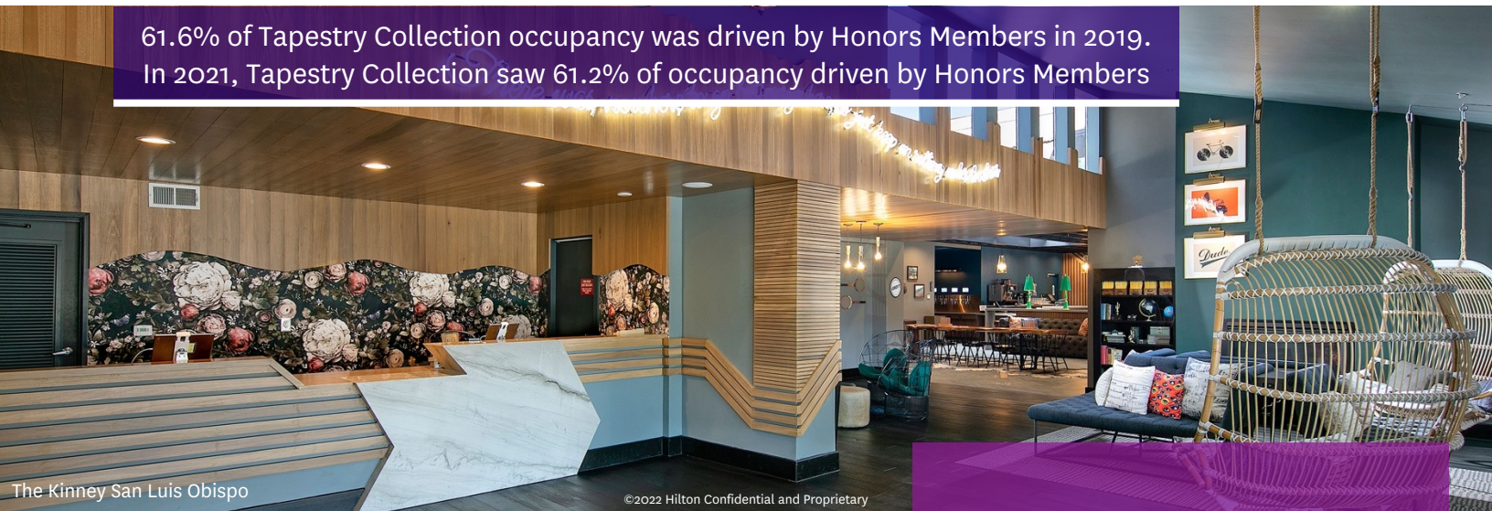
The Kinney San Luis Obispo

61.6% of Tapestry Collection occupancy was driven by Honors Members in 2019. In 2021, Tapestry Collection saw 61.2% of occupancy driven by Honors Members