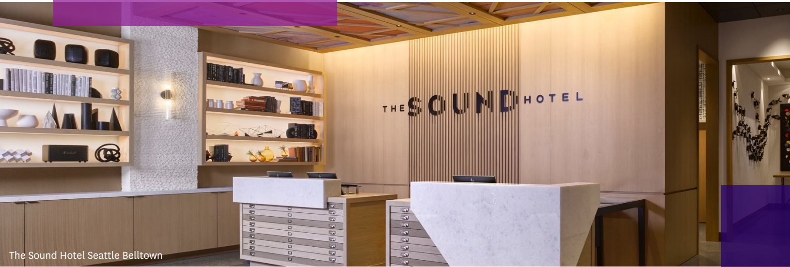
The Sound Hotel Seattle Belltown