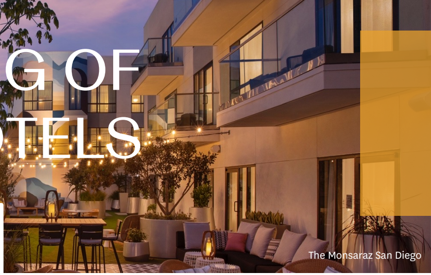
The Monsaraz San Diego