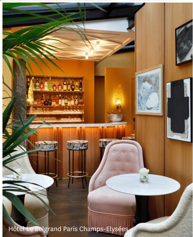
Hôtel Le Belgrand Paris Champs-Élysées

Tapestry Collection by Hilton™ is a portfolio of original hotels that offer guests unique style, vibrant personality and an authentic connection to their destination. Whether city center or off the beaten path, every Tapestry Collection property is connected to the local fabric and has a story to share.