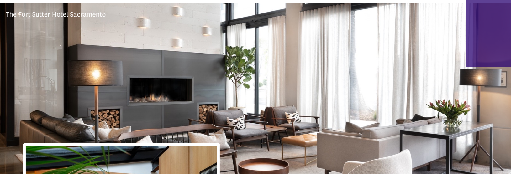
The Fort Sutter Hotel Sacramento